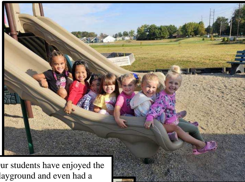
Our students have enjoyed the playground and even had a visit from the local firehouse.