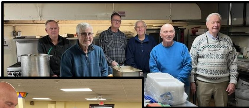
Men's Saturday morning Bible study group served the January meal at Robert's Park UMC.