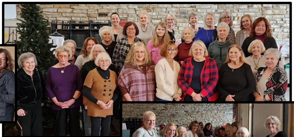
The women assembled 125 care bags for cancer patients at their January Women's Breakfast.