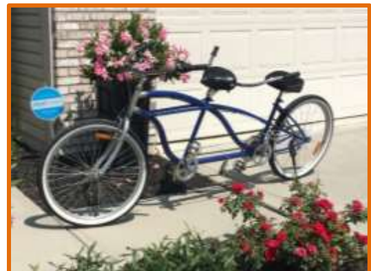
The most unique item donated was a bicycle built for two.